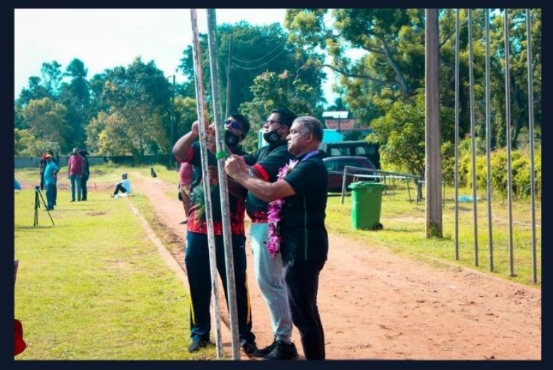
Hoisting the Flag